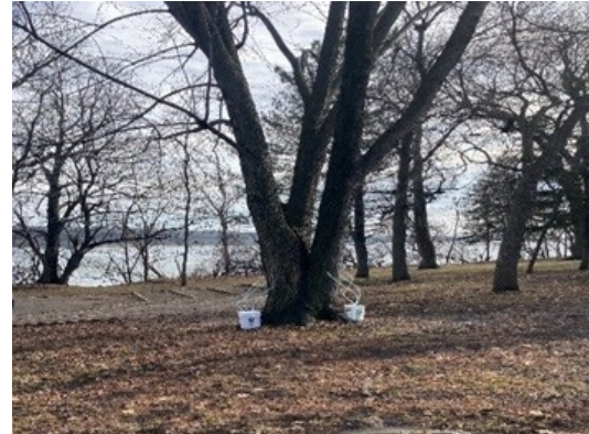
Tapping Trees for Sugar Bush